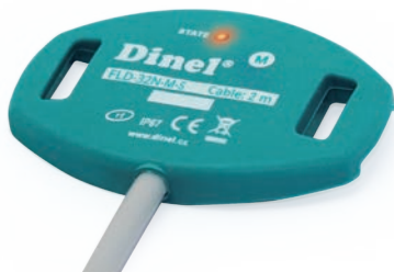
FLD-32 "Flexi Watch"