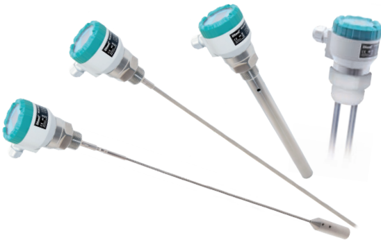
Capacitive level meter CLM-70

A new product line of CLM-70 capacitive level meters with a display for showing measured data and HART ® communication. It is intended for continuous level measurement of liquids and solid materials in all industrial branches.