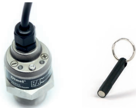
Hydrostatic level meter HLM-35 and magnetic pen for setting