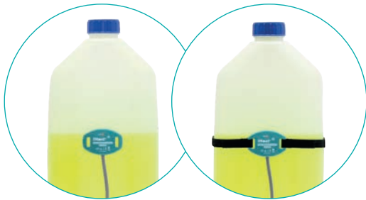
Dual fastening of FLD-32 using self-adhesive layer and attachment bands

Surely you must have encountered our level sensor FLD-48 called "Medusa". After 10 years we decided to let the Medusa swim away and now we have designed a completely new thru-wall level sensor FLD-32 "Flexi Watch".