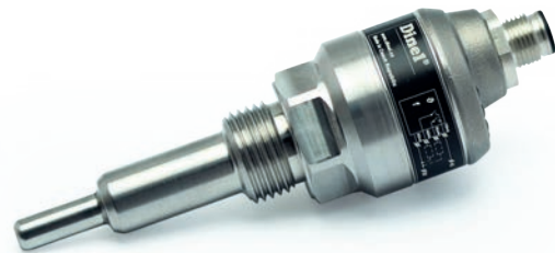
TFS-35 with longer stem

Check out our complete offer at www.dinel.cz