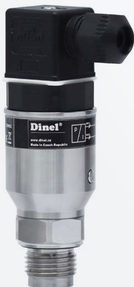
our first universal pressure gauge

Dinel , brings you another overview of news in this form. If you are interested in a product - use the QR codes linking to our website www.dinel.cz , where you can find detailed information about each product or you can send us directly even a non-binding inquiry. We look forward to seeing you this year personally. A list of planned trade fairs can be found at the end of this NEWS. Stop by at our stand where you will be able to see all our new products and have a live chat about anything that interests you.